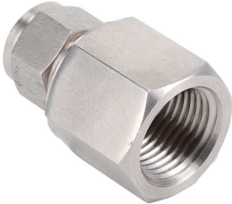
Dimensional Details :